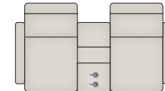
OPT. 194 78" THEATER SEATING